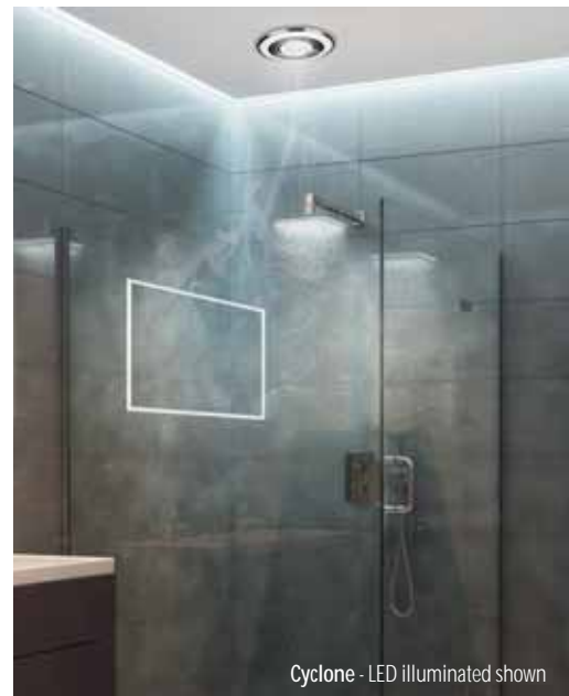
Cyclone - LED illuminated shown