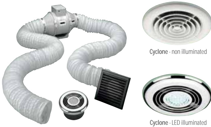
Cyclone - non illuminated