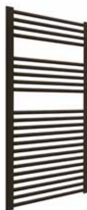
Mocha Brown Textured