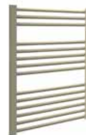
Latte Beige Textured