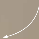
Espresso Gloss Rail

Hot tip! Coloured rails have around 30% more heat output than Chrome rails