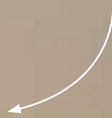
Espresso Gloss Rail

Hot tip! Coloured rails have around 30% more heat output than Chrome rails