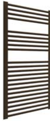
Mocha Brown Textured