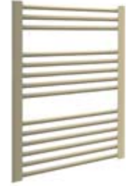
Latte Beige Textured